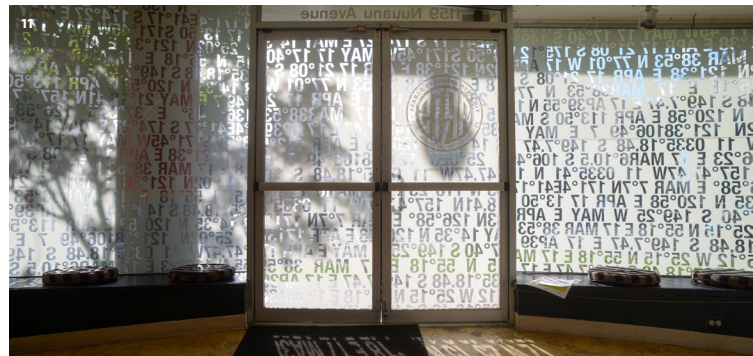
The ARTS at Mark's Garage