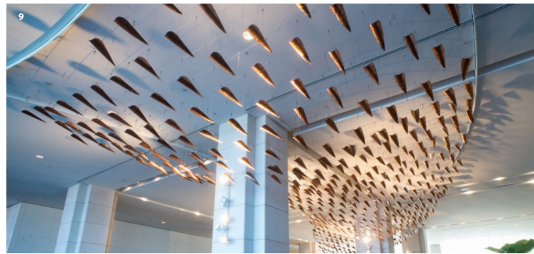
The Hawaii Prince Hotel Waikiki