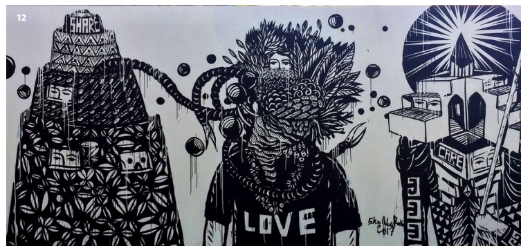
Shangri La Center for Islamic Art & Cultures