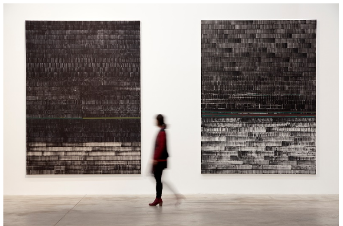
Installation view: Eye and Landscape, Bombas Gens Centre d'Art, Valencia, Spain. February 12 - September 12, 2021