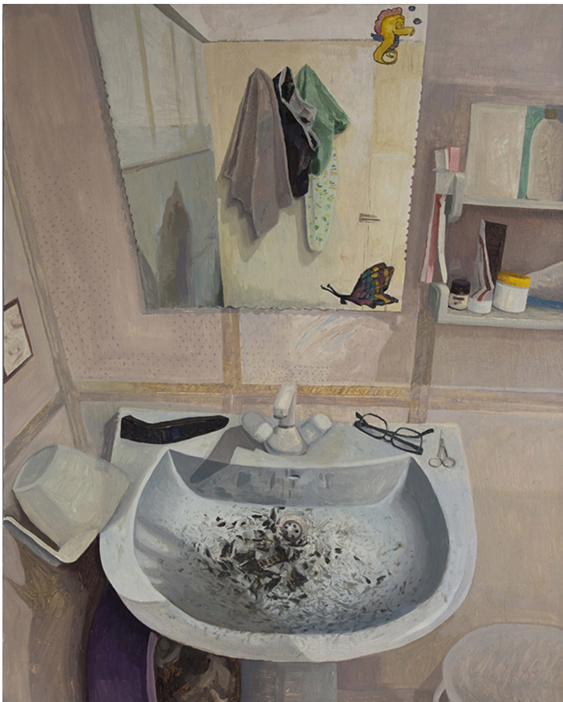
The Sink , 2020 Oil on canvas 76.2 x 61 cm