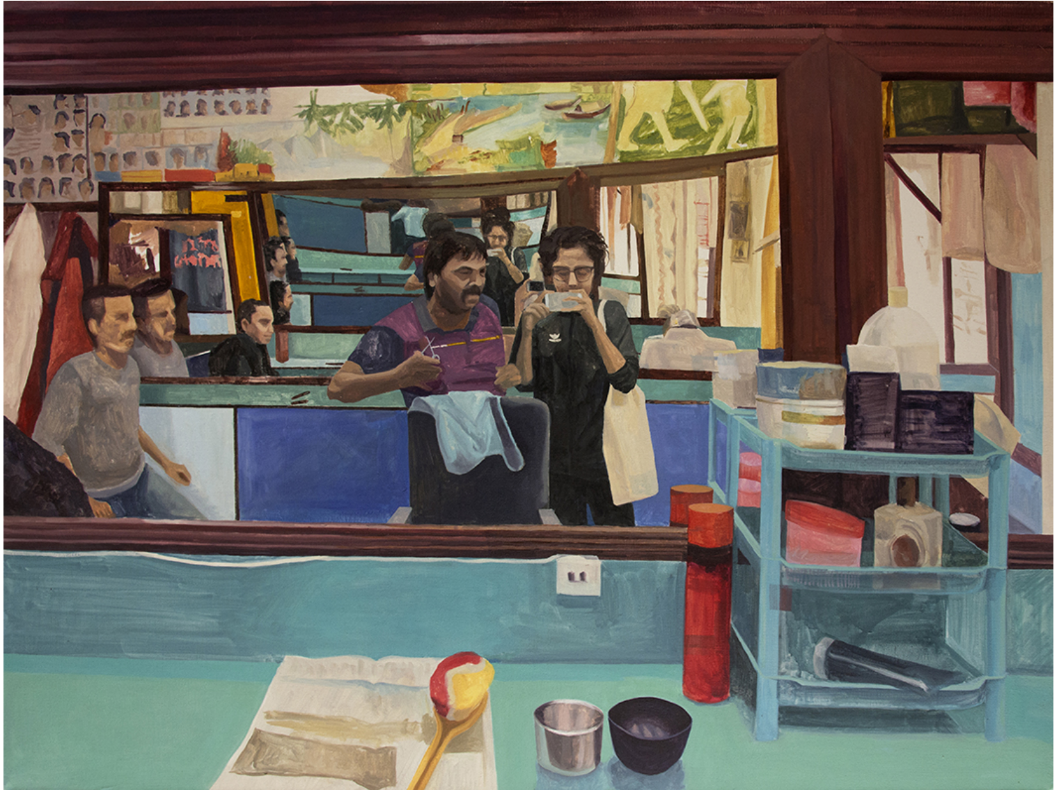
Shining , 2020 Oil on canvas 91.5 x 122 cm