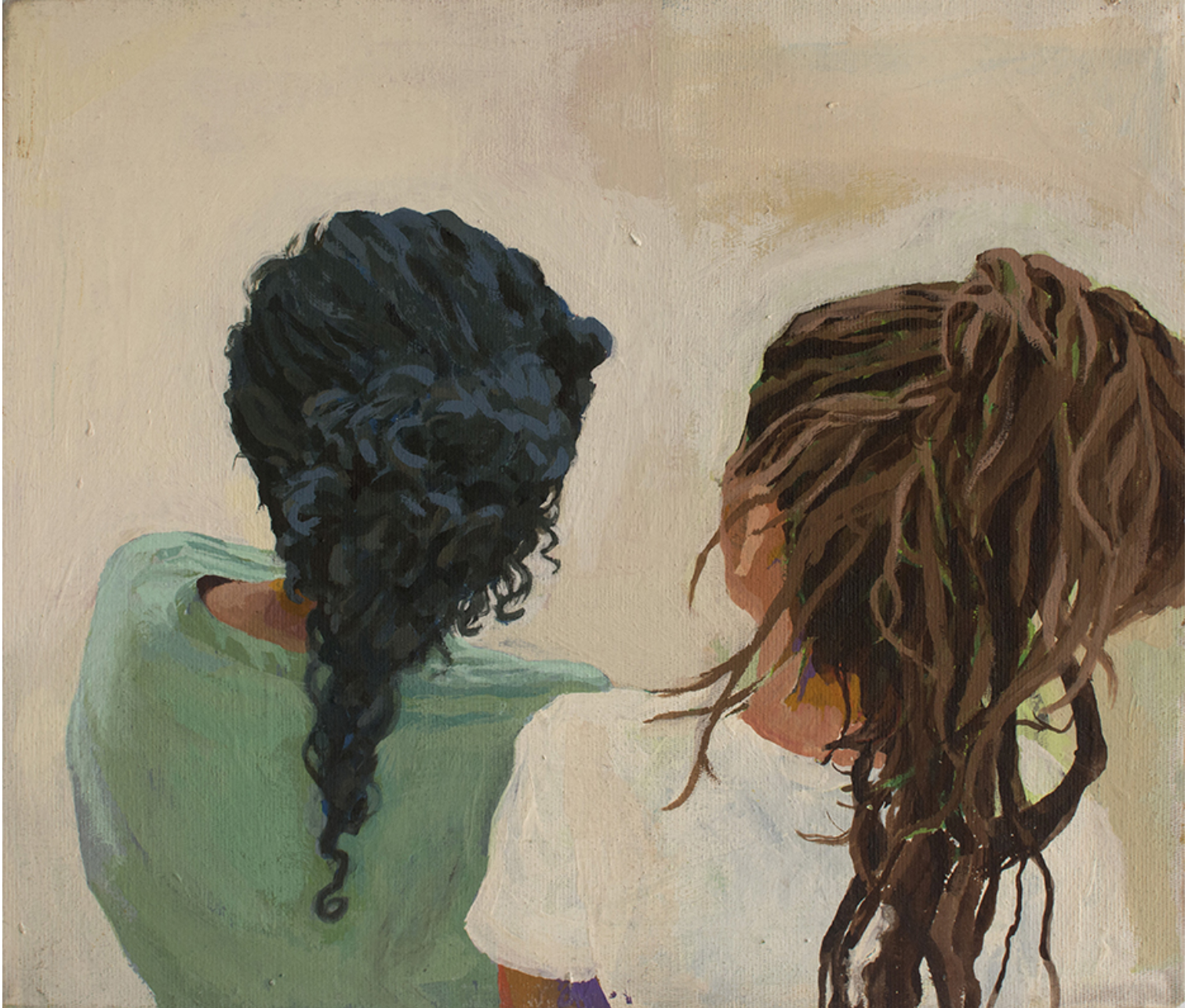
Two Heads , 2017 Emulsion and dye on canvas 25.5 x 30.5 cm