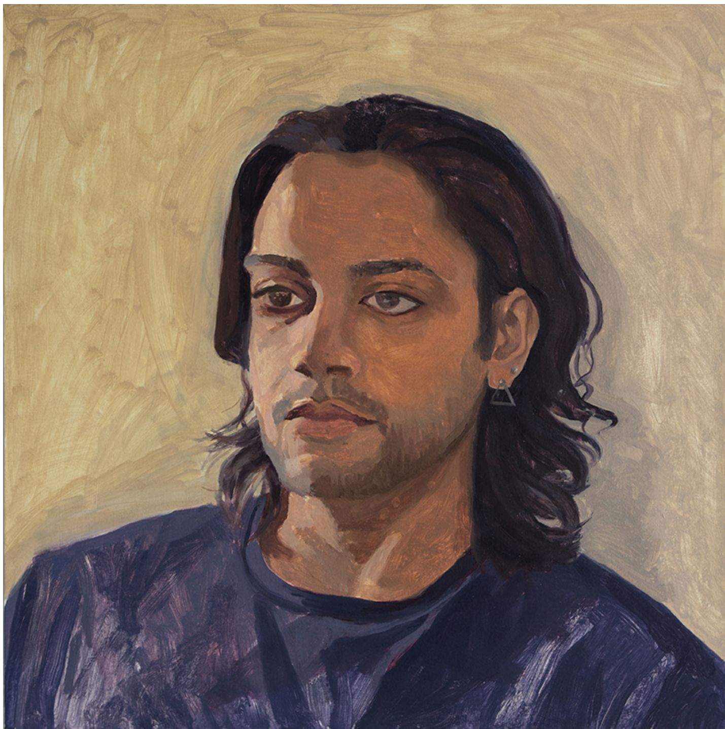
Umair , 2021 Oil on canvas 45.7 x 45.7 cm