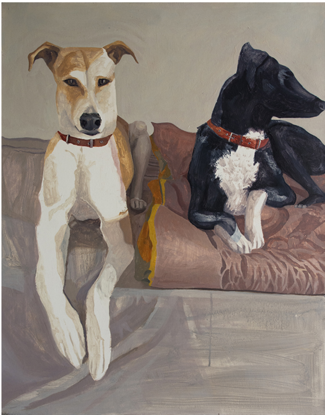
Storm and Cookie , 2020 Oil on canvas 76.2 x 61 cm