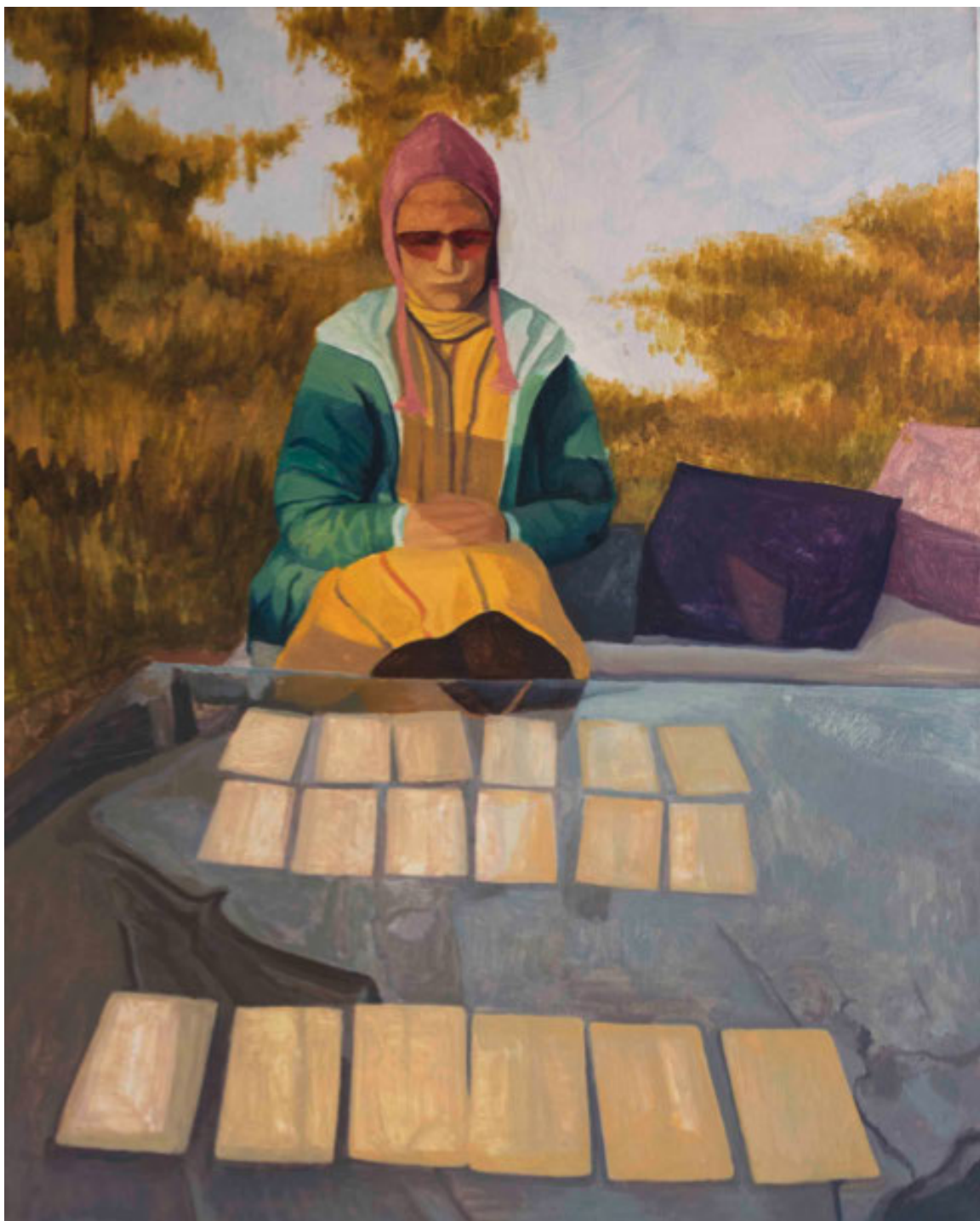
Iva's Spread , 2020 Oil on canvas 76.2 x 61 cm