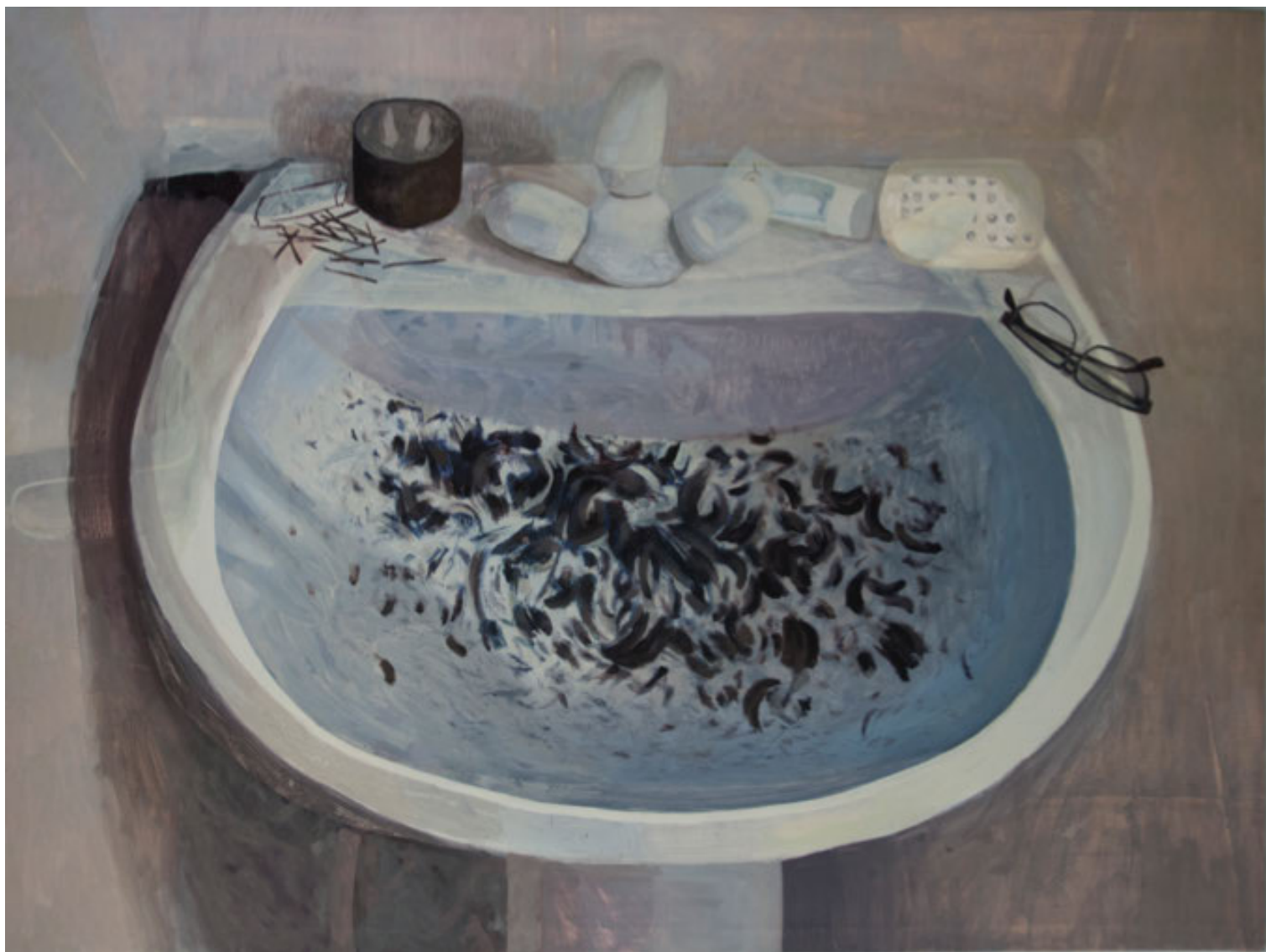
Big Sink , 2021 Oil on canvas 91.5 x 122 cm