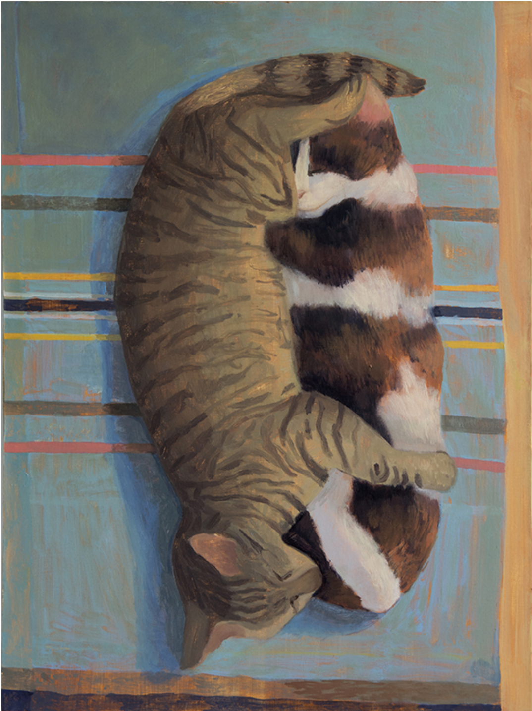
Spark and Bite , 2021 Oil on canvas 61 x 45.7 cm