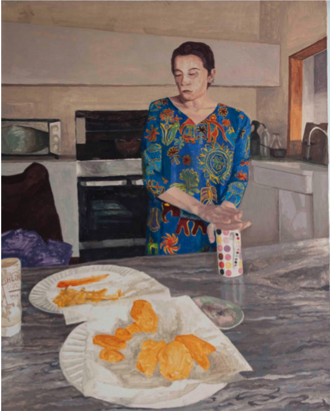
Heartbreak Pakoras, 2020 Oil on canvas 76.2 x 61 cm