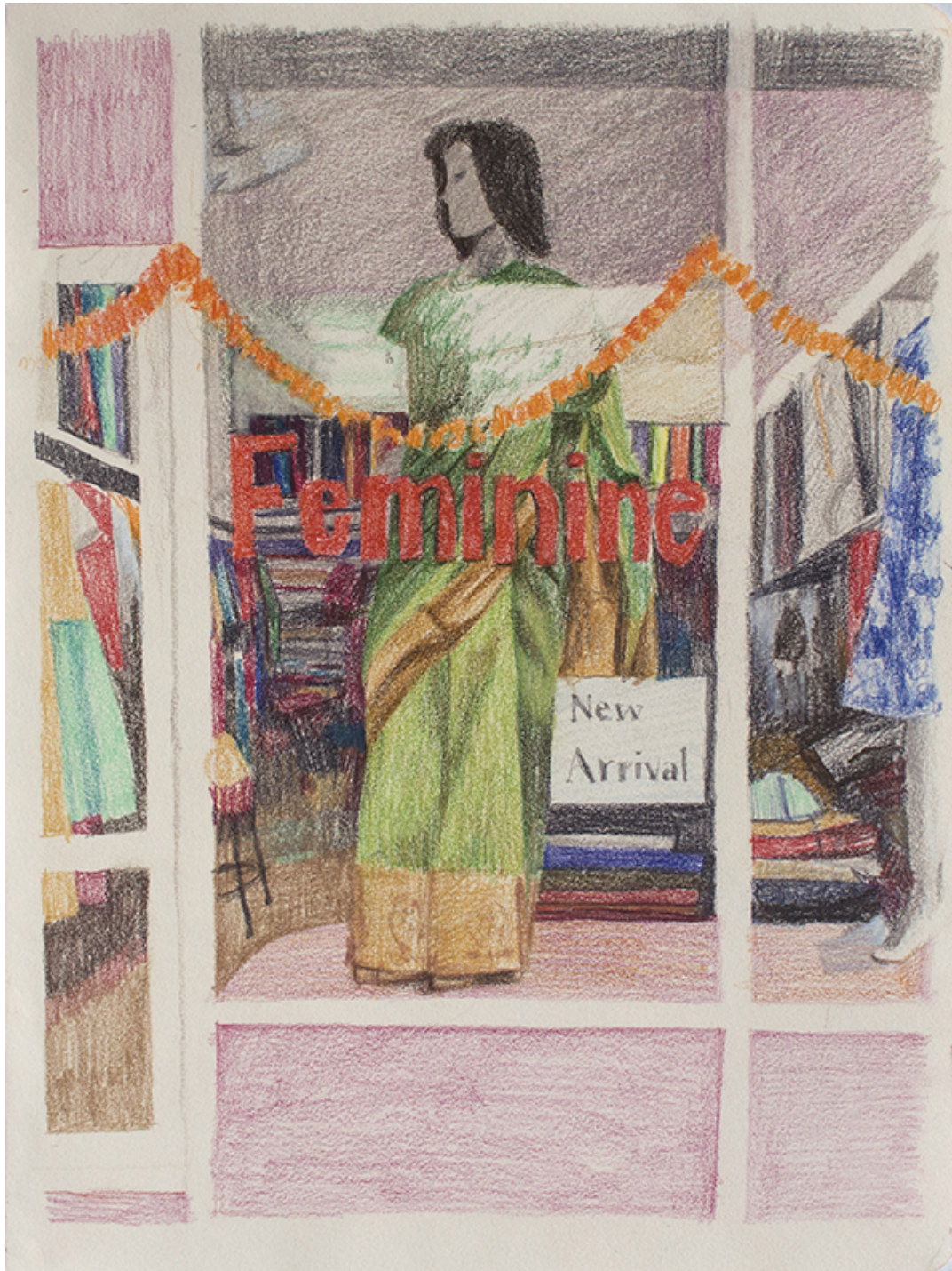
Feminine , 2020 Drawing, colour pencil on paper 28 x 20.2 cm